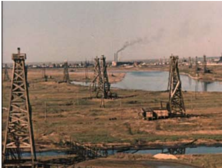
Fig. 8. A frame from the film “The Saga of Siberia”