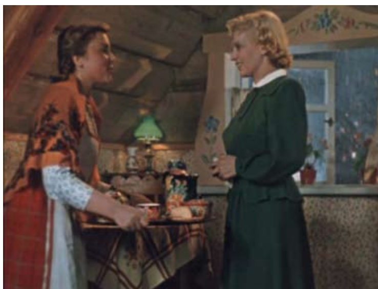
Fig. 1. A frame from the film “The Saga of Siberia”

community of the capital (composers, musicians, participants and fans of the musical contests), who are professional and talented but avoiding a direct conflict with life (many of them never served at the front, were disparaging towards working people) (Fig. 3). The second world is a Siberian province, “new life”, which starts on undeveloped territories where one has to subjugate the nature, work on construction sites. This life is dull and devoid of cultural extravagances from the capital elite's point of view but can give a person solitude and a possibility to face both natural elements (Andrey, the main character, composes his musical piece while romantically and pensively wandering in a snow storm) (Fig. 4) and working people, emotionally open to the world (Fig. 5). As the film was produced in the epoch of “plotless” films, these worlds do not conflict with each other: Andrey respects the talent of Boris, a bohemian musician. As for a Siberian province, it is shown here as a world of a romantic dream, escape from civilization, deprived of truth, into new future where one can obtain the source of true inspiration. It is not without reason that in the end of the film Andrey, a composer, with Natasha, his