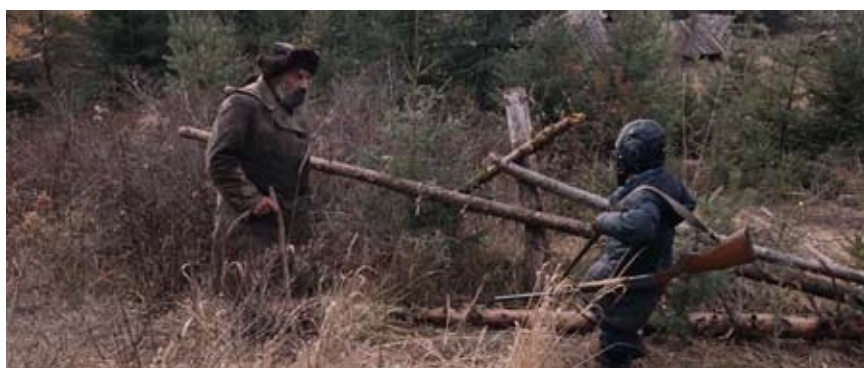
Fig. 11. A frame from the film “Siberia. Mon amour”

film festivals, was noticed by Luc Besson who initiated the film's cinema distribution in France. In the long run, the film turned to be one of the most unprofitable in Russian cinema distribution. This fact along with its festival awards makes it possible to consider it to be art house. In France the film was more successful in its cinema distribution than in Russia. This fact, probably, proves that the target audience of a Siberian film had to be foreign viewers who are still interested in drama films in which the events unfold in the exotic places of the planet (for example, Africa, Thailand, Siberia, etc.). This phenomenon is devoted some lines in N. Sputnitskaia's article in which she ironically criticizes the film, turning its plot and dramatic basis into a caricature by her words: “Nevertheless, Luc Besson, a European, has become an accomplice of cutting the film about