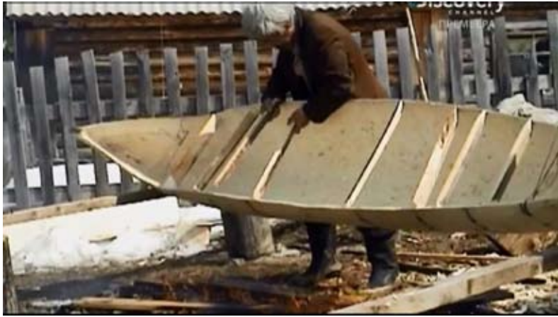
Fig. 27. A frame from the film “Happy People”