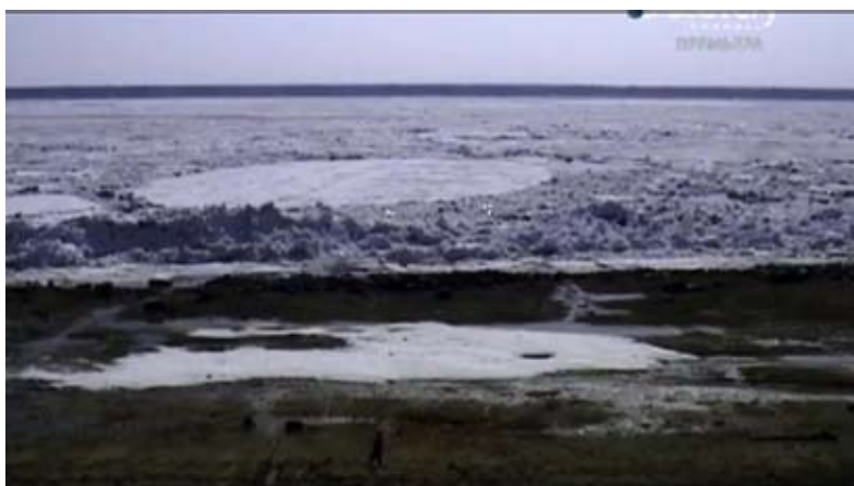
Fig. 32. A frame from the film “Happy People”

people. The off-screen commentary on the portrait of Mikhail Tarkovsky, a writer, gives the following explanation of the reason of his life in the taiga: “... there are neither rules, laws, taxes nor telephones, radios here; there are only personal values and norms of behaviour...”.