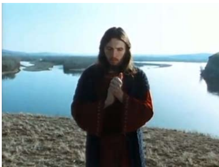
Fig. 22. A frame from the film “Bells from the Deep”