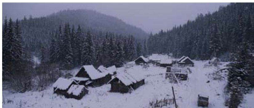
Fig. 10. A frame from the film “Siberia. Mon amour”