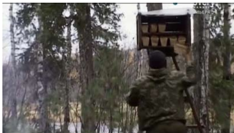
Fig. 30. A frame from the film “Happy People”