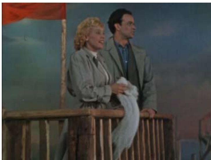
Fig. 2. A frame from the film “The Saga of Siberia”