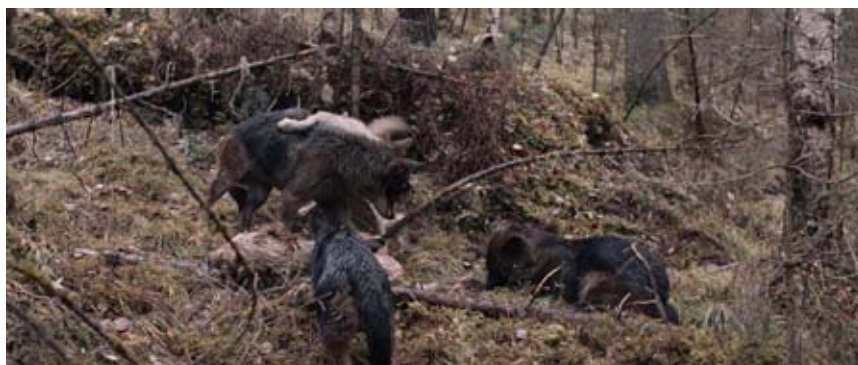
Fig. 14. A frame from the film "Siberia. Mon amour"

Everything in the film (a visual image of the shots, on the one hand, and a "tall tale" about Siberia and Russia, on the whole: vodka, shabby wooden houses, an old man in a cap with earflaps, constant trust in God) develops against the background of monumental Siberian nature (high mountains, a cold river, pitch-dark forests with hardly penetrable paths) (Fig. 15). Practically all the texture of the film is artificially made and shot with a photographic admiration: Monamur village is built especially for the film, the sculpture of huge hammer and sickle on the mountain, against the background of which the grandfather, an old believer, dies, is made from cardboard (Fig. 16), cruel abandoned dogs were played by real trained Canadian huskies, etc.