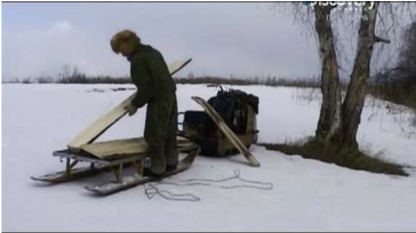
Fig. 26. A frame from the film “Happy People”