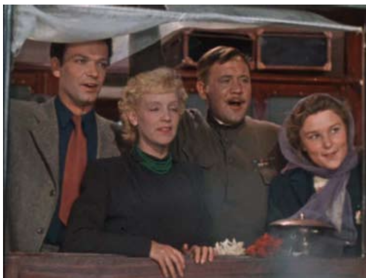
Fig. 6. A frame from the film “The Saga of Siberia”