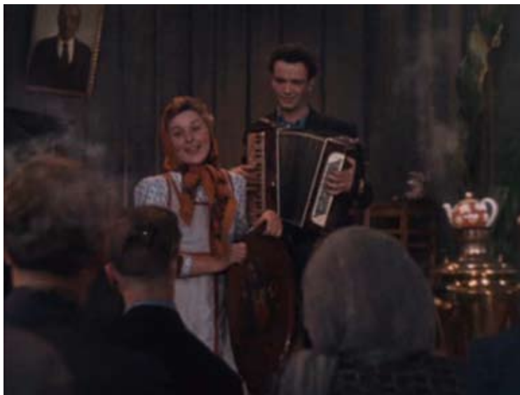
Fig. 5. A frame from the film "The Saga of Siberia"

"Skazanie o zemle sibirskoi". It depicts another interesting aspect of the concept of Siberia. Thus, the scenes of a concert hall with the main character's triumph are changed by a photo-film that narrates about the history of Siberia from the times of Yermak's march (Fig. 7) to grandiose construction projects of Soviet times (Fig. 8). Poems about Siberia sound against the background