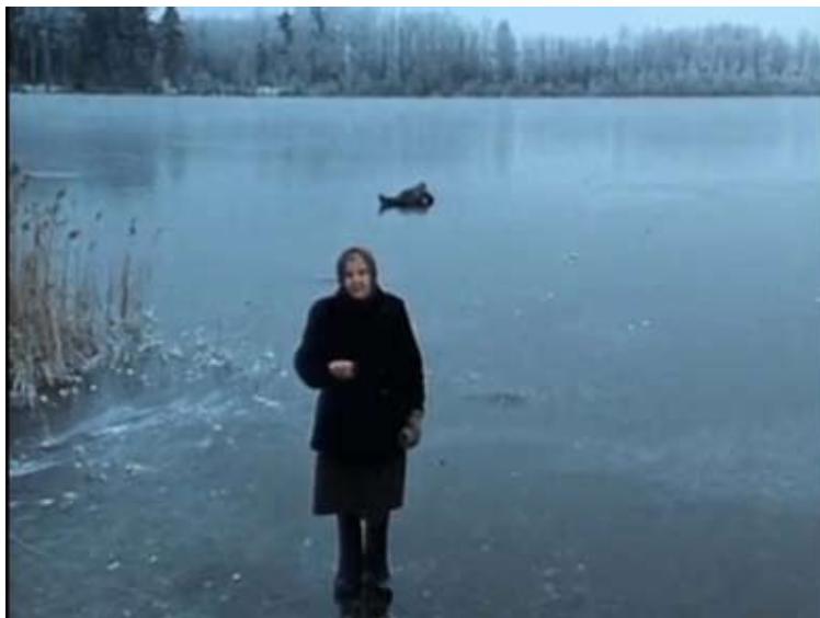
Fig. 24. A frame from the film “Bells from the Deep”

crawling on the ice of the Lake Svetloyar, stages the desire to turn unusual religiousness into more complicated and absurd one. At that this film can be by no means regarded to be a vision of Russian religiousness as some madness. This is the way the film director presents religious rituals around the world. For example, catholic religion is adopted by the African tribes the same absurd way as the