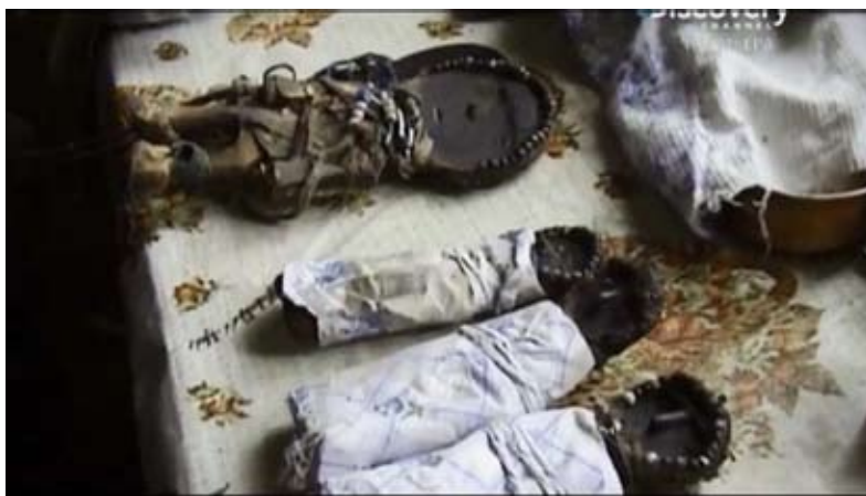
Fig. 31. A frame from the film “Happy People”