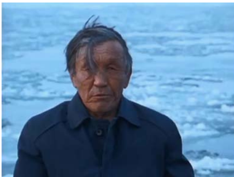
Fig. 21. A frame from the film “Bells from the Deep”