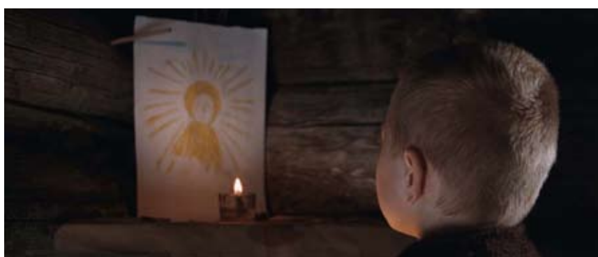
Fig. 19. A frame from the film “Siberia. Mon amour”

of Siberian nature didn't come true, the nature here gained its victory over a human.