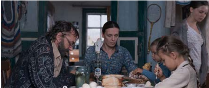
Fig. 12. A frame from the film “Siberia. Mon amour”

is afraid of being reproached by Anna for eating their family away). At that some basic values are broken in the family: Anna has got a lover, she forbids her husband to help Alyoshka and his grandfather in Monamur as they had enough problems of their own. The third plotline (Fig. 13) is about the story about compassion arousing a human’s consciousness. It happened to a soldier-nationalist who returned from the Caucasus wars, an open-hearted young recruit and a prostitute, whom both militaries start defending in a military unit. All the plotlines meet with each other: the story about Yury and Anna’s family has a tragic end: Yury is torn to pieces by the dogs in the wood, Anna is stuck in the snow-covered taiga without knowing how to find her way out of it but she manages to revenge on the bandits who stole the icon. As for the lines of the grandfather,