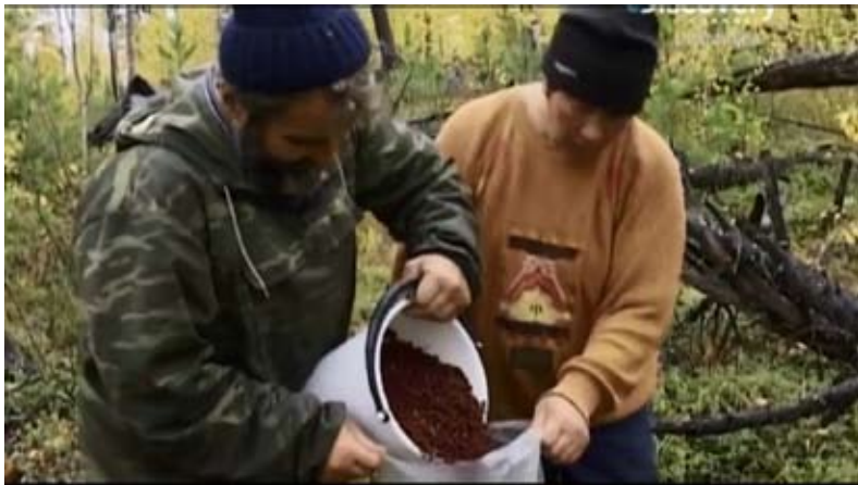
Fig. 28. A frame from the film “Happy People”