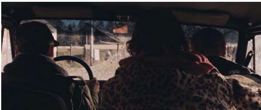
Fig. 13. A frame from the film “Siberia. Mon amour”