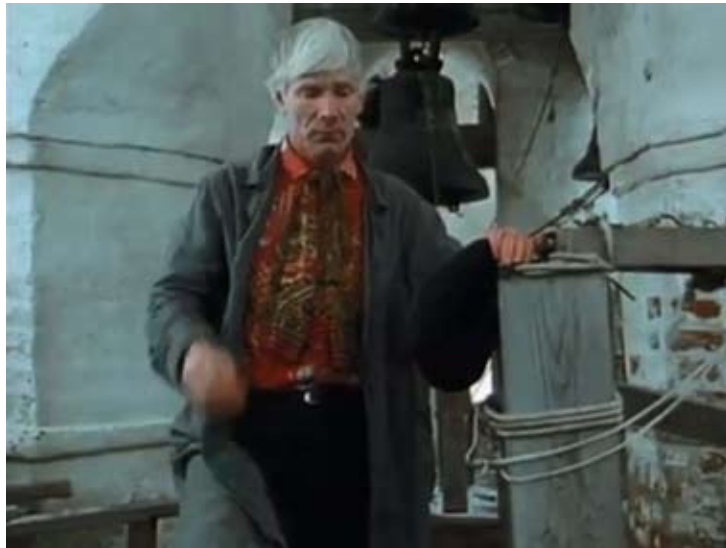
Fig. 23. A frame from the film “Bells from the Deep”