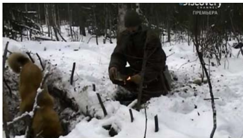
Fig. 29. A frame from the film “Happy People”

of civilization disappeared. It is not without reason that a minor people – the Kets – grieve for having forgotten their own trades and being busy with one thing only. This thing is chopping firewood. Together with alcoholism it leads this people to extinction. The film renders the idea that the people, who forget their traditional trades, die out. That's why the film gives a special focus to a story of one Ket old woman, who hasn't forgotten traditional practices. What she can do is making dolls-the house keepers (Fig. 31). Being archaic nowadays, this practice turns out to be extremely valuable as its vanishing leads to dying out of the whole