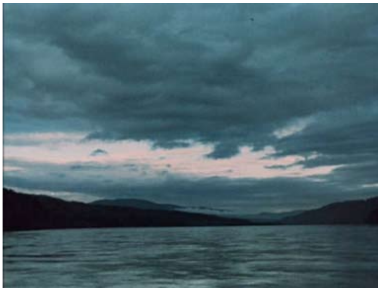
Fig. 9. A frame from the film “The Saga of Siberia”

which are not hidden behind social norms and rules; b) Siberia is a “kettle” in which social classes (and namely creative intelligentsia and workers) melt; c) Siberia is a place of exile of progressive ideas, leaving their time behind, a place from which they return afterwards, bringing revolutionary reforms to the whole country.