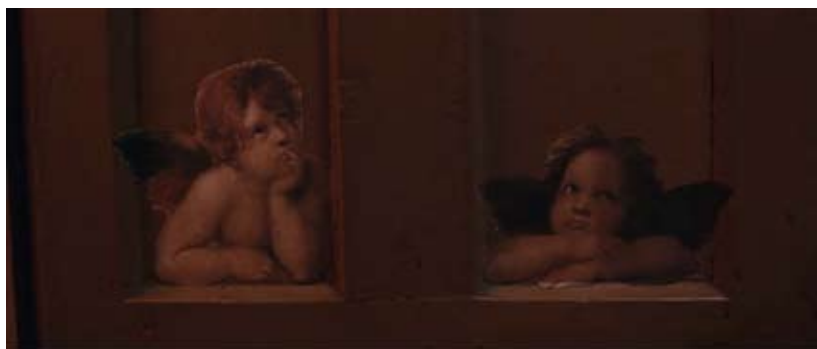
Fig. 18. A frame from the film “Siberia. Mon amour”