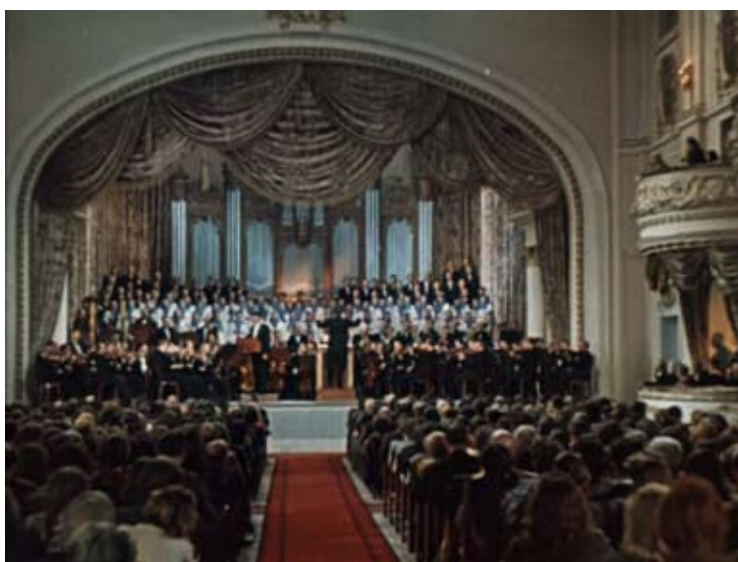
Fig. 3. A frame from the film “The Saga of Siberia”

wife, leaves for Krasnoyarsk, for that new Siberian life, when blending of classes is possible, working class and intellectual elite communicate sincerely and with good respect. Thus, in a final scene of the film Andrey and Natasha meet their friends, a married couple of Yakov, a driver, and Nastya, a waitress, and sing a happy song together (Fig. 6). It should be noted that the signs of romanticism in