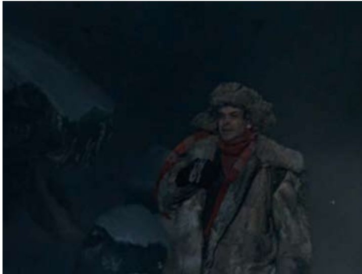
Fig. 4. A frame from the film "The Saga of Siberia"