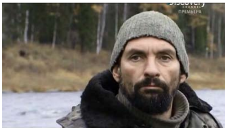
Fig. 25. A frame from the film “Happy People”

A key accent of the film is a story about trades, which hunters and fishermen in the taiga are good at. The trades are dwelt upon in such a detailed way that the viewers seem to practically apply this knowledge themselves in case it is needed. The trades, the secrets of which are opened by the interviewed, are the following ones: the secret of setting hunters' traps in the forest – how to make a trap, how to get an animal trapped, how to find a trap in the taiga; the secret of making skis for various seasons (Fig. 26); the secret of making boats, starting from choosing a log and finishing with the method of its burning for a boat to have its form (Fig. 27), the technique of driving a boat; the secret of gathering and mass processing