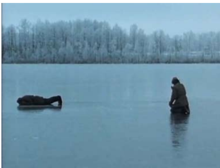
Fig. 20. A frame from the film “Bells from the Deep”

“Bells from the Deep” presents a great number of “wild” religious rituals. In it, like in his other films, W. Herzog dispassionately watches certain phenomena with curiosity but without empathy and penetration to their heart. Religious rituals or interviewed characters turn out to be the exhibits of the museum of unusual rarities: first we see the pilgrims to Kitezh, crawling on ice of the Lake Svetloyar and trying to hear the ringing of the bells from under it (Fig. 20); then we see the Khakass shamans performing their purificatory rituals to fight with evil spirits in the house to the sound of deep-throat singing