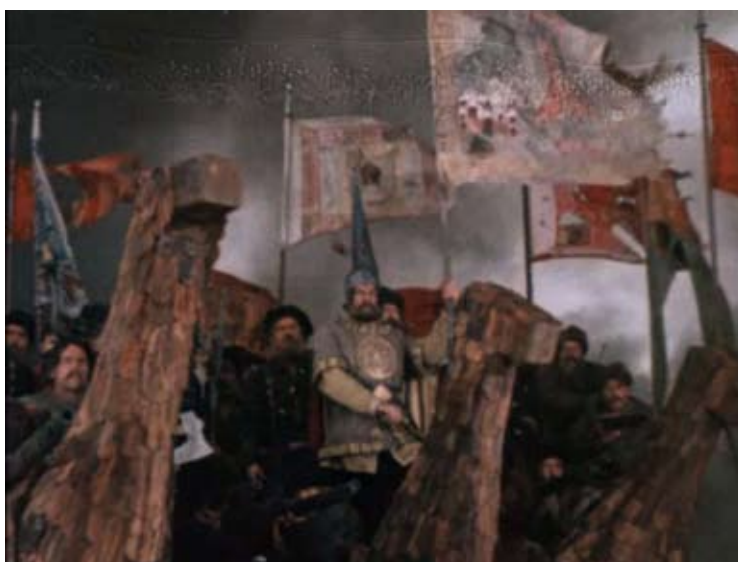
Fig. 7. A frame from the film “The Saga of Siberia”

to Russia to be at the head of the battles...”. These lines lead to a non-traditional understanding of Siberia which is viewed not only as a place of exile but a place to which Russia’s most progressive representatives were exiled and from which advanced views returned to Russia some time later to introduce revolutionary changes into the life of the whole country.