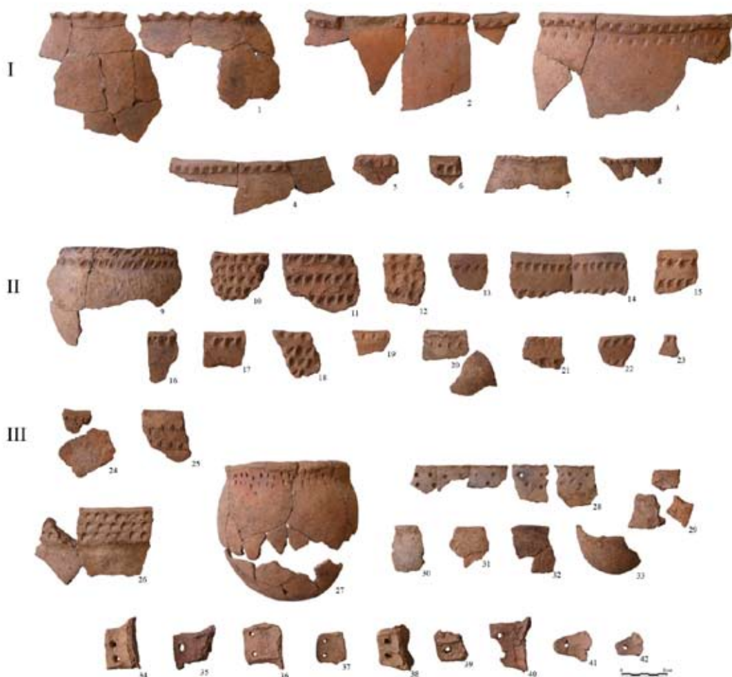
Fig. 1. Ceramic vessels of the Zaostrovka-2 settlement based on excavation materials in 2006

13 pcs) show that there are smudge-vessels in the collection. Typologically, eyelets are divided into three groups: 1) rectangular-shaped with two holes (8 pcs), 2) tongue-shaped with one hole (2 pcs), and 3) tubular with a round hole (1 pc).